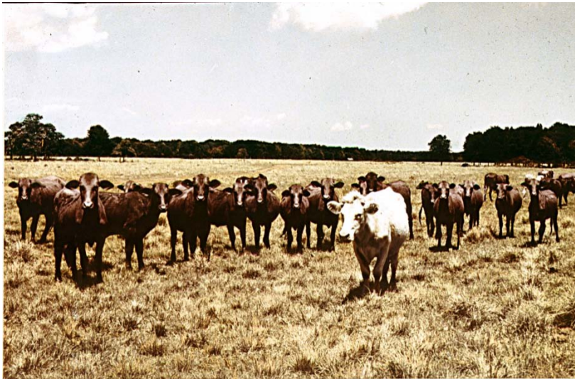
MSC SITE JANUARY 1962

LEE: Oh yes, where we built the Space Center, it was in a cow pasture, as shown by this photo: