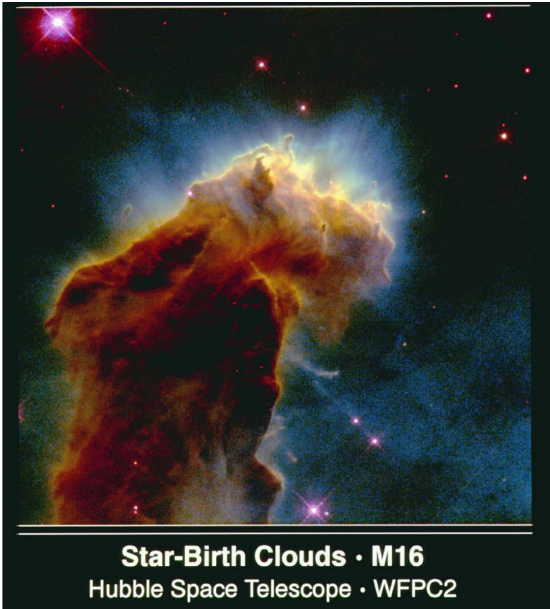
Star-Birth Clouds • M16 Hubble Space Telescope • WFPC2