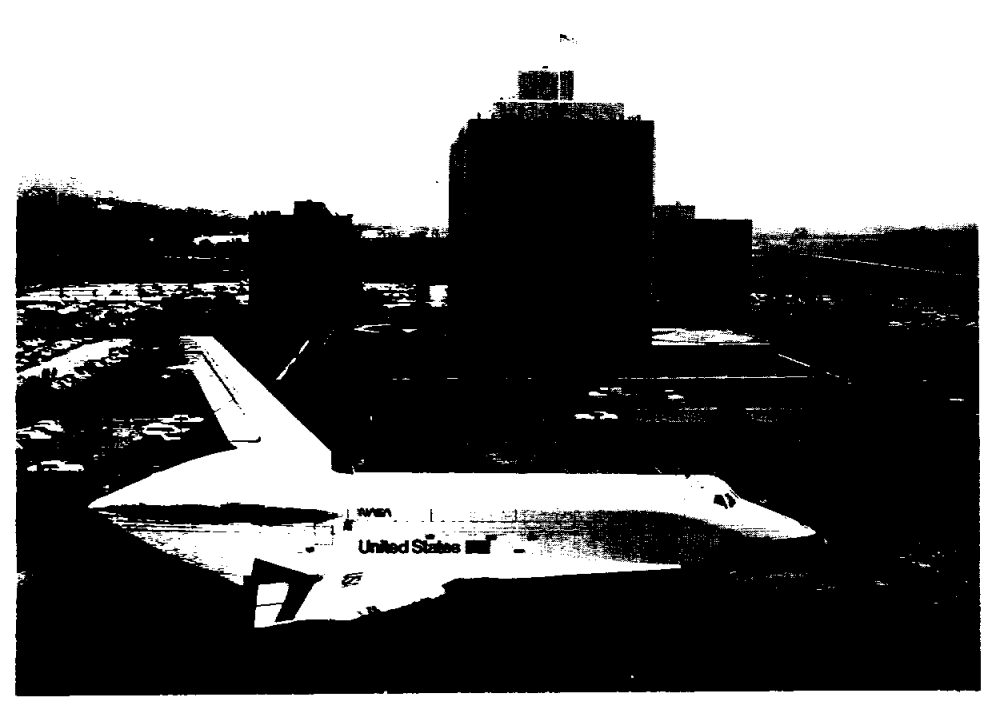
ENTERPRISE REMOVED FROM FERRY POSITION — Tuesday night, Mar. 14, the Enterprise was removed from atop the 747 and transported past the Marshall Center Headquarters complex the next day. It was placed in a hangar-type building where it will be prepared for the series of ground

At the Marshall Center, the Orbiter will be joined by other major Shuttle components, the external tank and the solid rocket boosters, for a series of ground vibration tests lasting several months.