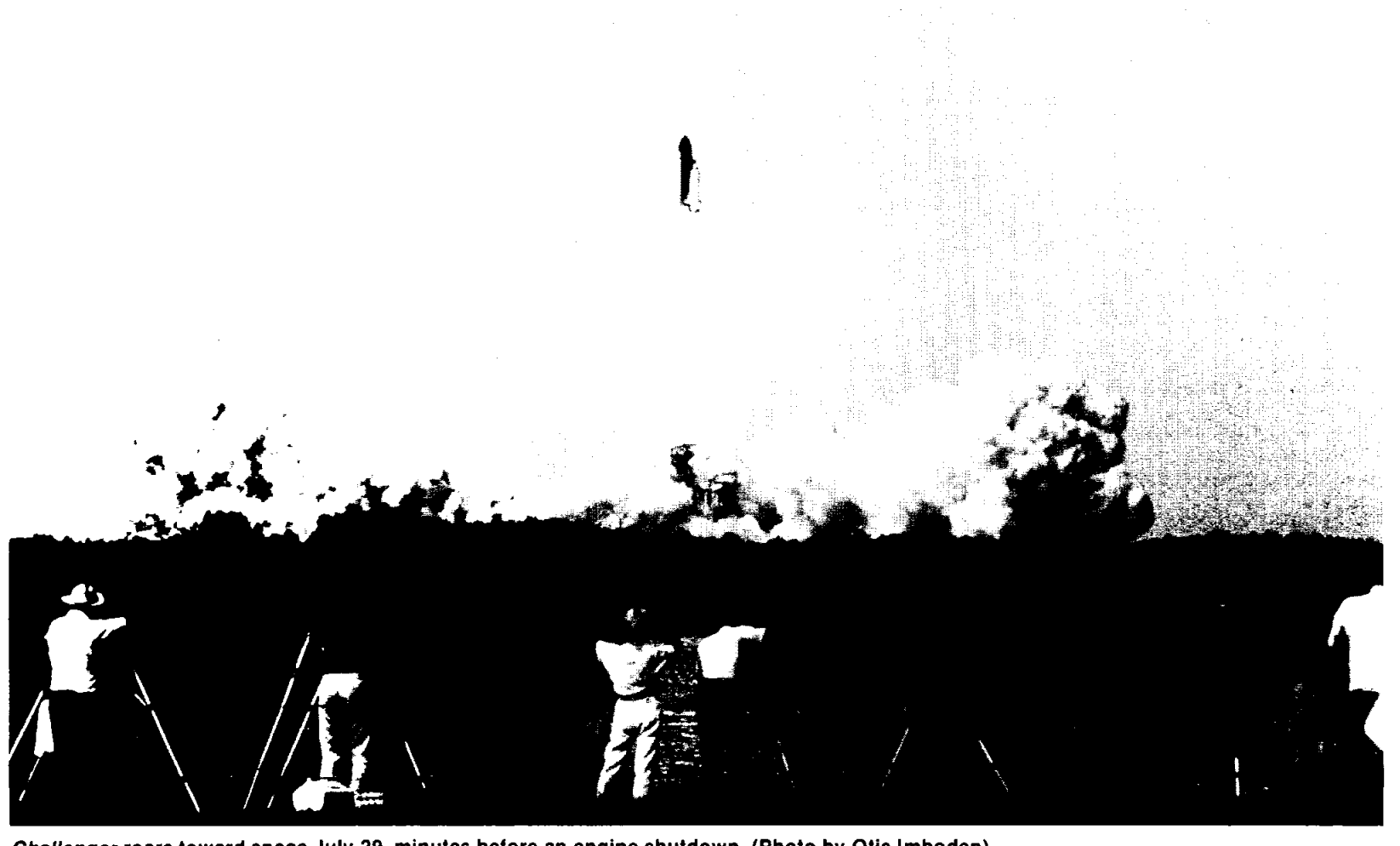
Challenger roars toward space July 29, minutes before an engine shutdown.

Sensors cited as cause of center engine shutdown on 51-F