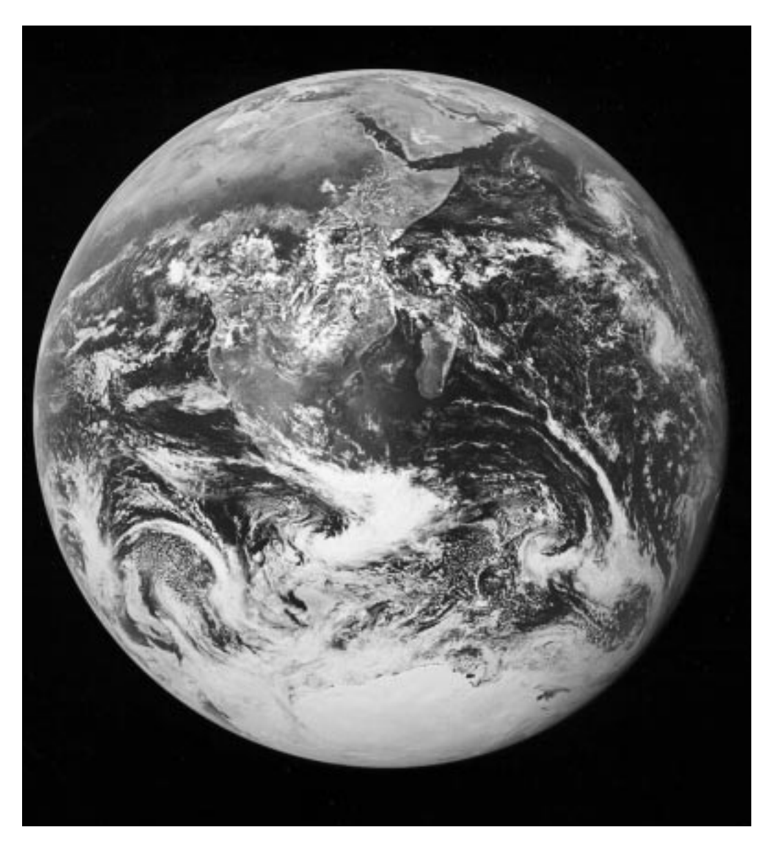
This Apollo 17 view of Earth is one of the most published photographs in the world. In explaining the impact of spaceflight, this one photograph has been worth many thousands of words.

By 1972, when President Nixon authorized development of the Space Shuttle, manned space programs by no means had been abandoned, but rather "slippage" in the broad time frame and other economies were intended to preserve the industrial and technological expertise derived from space, provide time for the absorption and distribution of the new knowledge, and preserve national leadership in space while concentrating national energies and wealth on war and the public welfare. MSC now