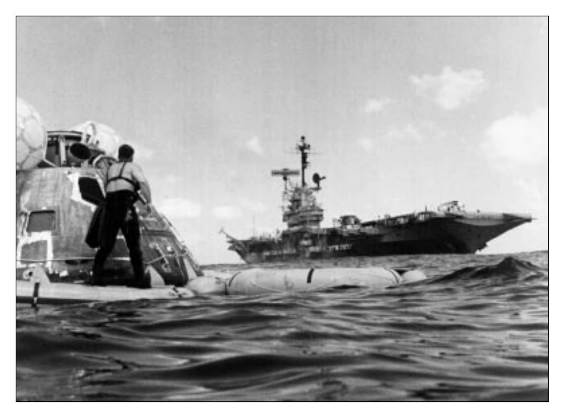
The Apollo 17 splashdown, marking the end of the Apollo lunar programs, occurred very near the U.S.S. Ticonderoga on December 19, 1972, about 350 miles southeast of Samoa in the Pacific Ocean.

support in 1970. It was to be a large orbiting workshop, using systems originally developed for Apollo (Apollos 18 and 19). The orbiting workshop/space station had evolved from that early vision of Von Braun and others to become a "dry" S-IVB capsule with a limited Earth-orbit life that would be manned by three different mission crews: the first for 28 days, and the next two for 59 and 84 days, respectively (originally scheduled for 56 days each). Slippages in scheduling caused largely by budget problems, delayed the Skylab missions to 1973-74. Another project using a Saturn-Apollo system was under consideration, but not yet authorized. For several years, the Nixon administration had been negotiating quietly with the Soviet Union for a combined U.S.S.R.-U.S. spaceflight as yet another means of de-escalating the cold war. That mission would fly in 1975, but it was still being defined and developed in 1972.